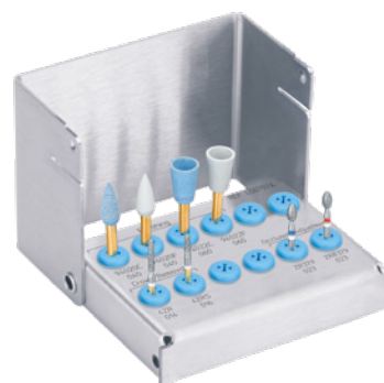
Kit Order LD0707A